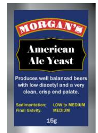
American Ale Yeast