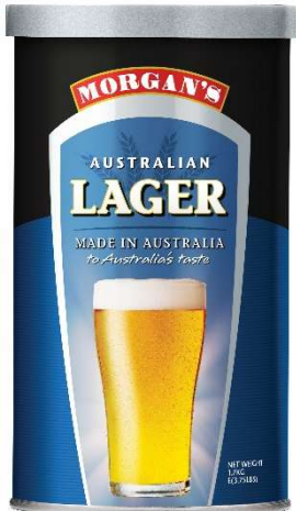
Morgan's Australian Lager