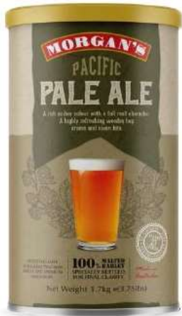
Morgan's Pacific Pale Ale