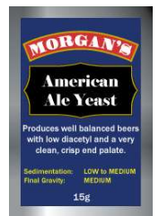
American Ale Yeast