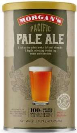
Morgan's Pacific Pale Ale