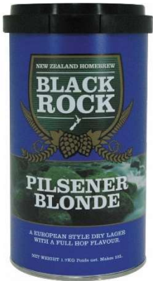
Black Rock Pilsner Blonde