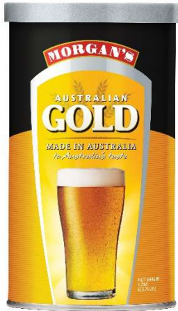
Morgan's Australian Gold