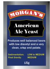
American Ale Yeast