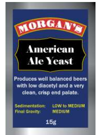
American Ale Yeast